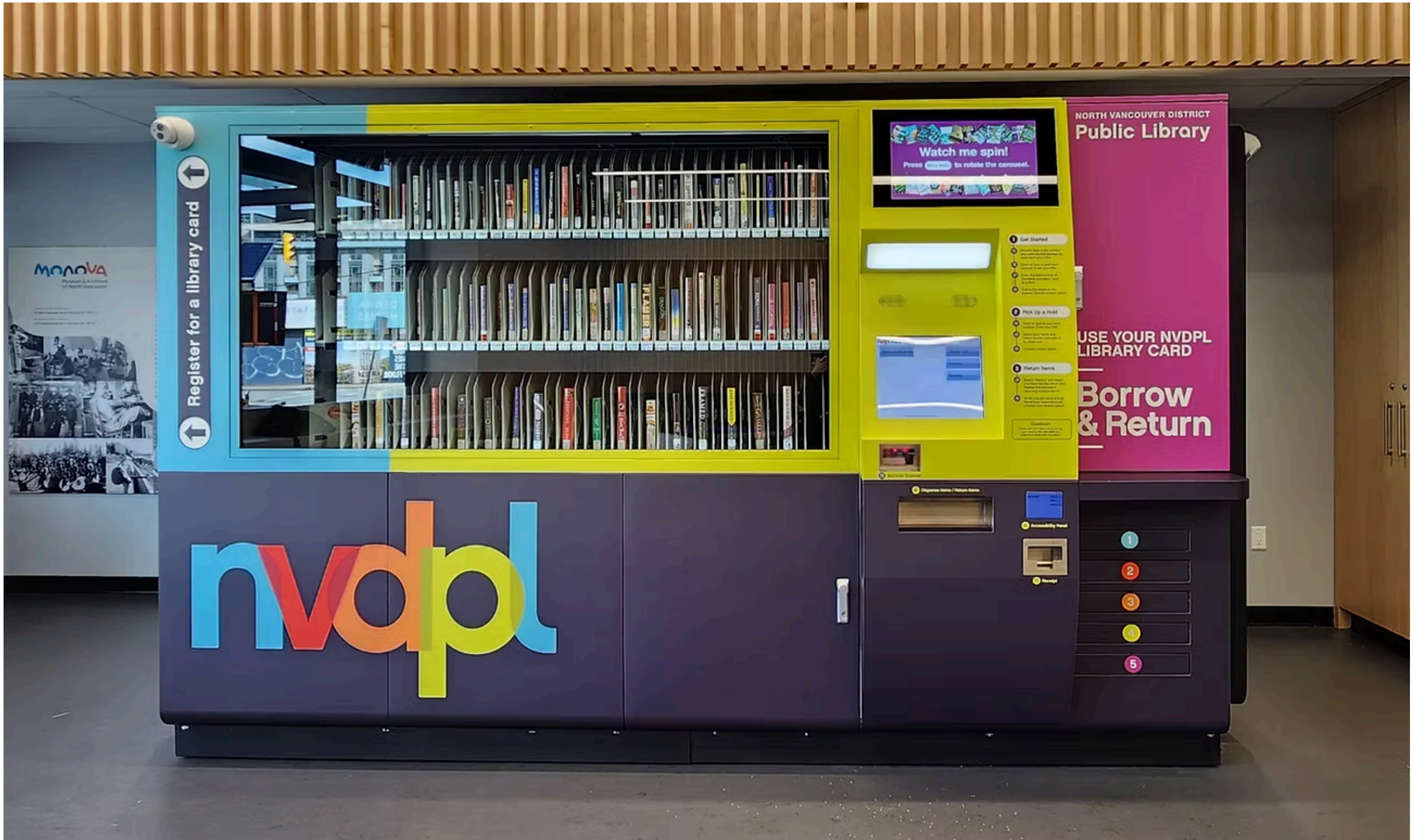
5. Envisionware 24-hour Library.